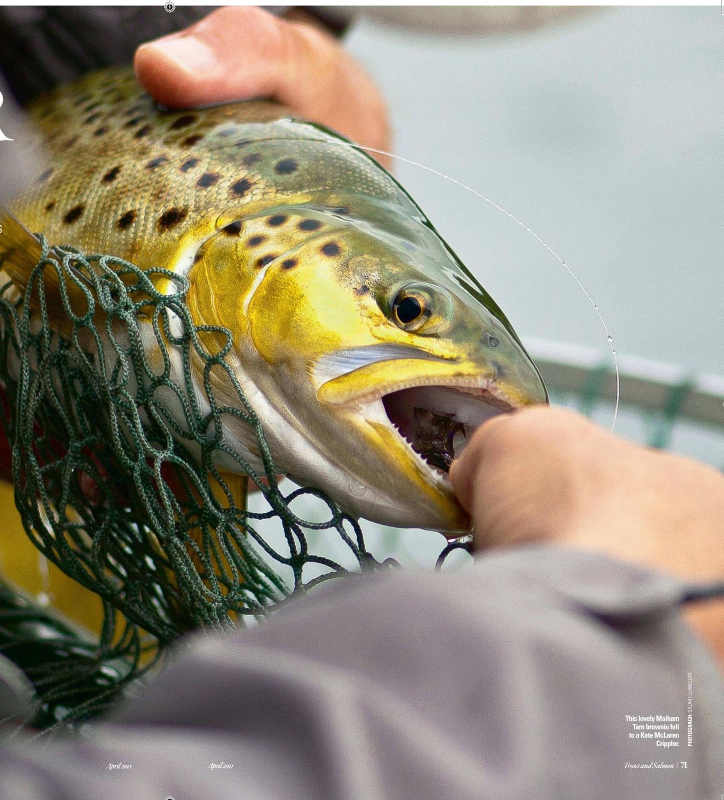
This lovely Malham Tarn brownie fell to a Kate McLaren Crippler.

In 2006 I’d had success with a Soldier Palmer variant by adding a red golden-pheasant (GP) body feather up front as a “shoulder” hackle. The GP body feather has a lovely gentle, springy quality, giving a soft “kick” – closing when pulled through the water, and opening wide when slowed down or left static. The long legginess of the GP was a big attraction, too, adding a further dimension at the hang, or dibble stage, giving a strong sense of legs, movement and general dishevelment irresistible to trout. Unknown to me at the time, the tinkering with the Soldier was to be the starting point for a whole series of variants based on some of the classic wet-flies. ►